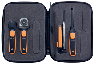
VAC Smart Probe Kit: 0563 0003